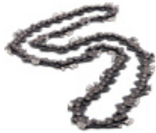
501 84 23-52 Saw chain PIXEL H38 3/8" MINI Pitch 1,1 mm

H38 is made for small saws and have chamfer-chisel cutters. It is a low-vibration/low-kickback chain. This chain is ideal for homeowners or consumer but also commercial users such as arborists. Designed for use on electric and on small gasoline-powered saws.