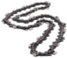
501 84 23-45 Saw chain PIXEL H38 3/8" MINI Pitch 1,1 mm

H38 is made for small saws and have chamfer-chisel cutters. It is a low-vibration/low-kickback chain. This chain is ideal for homeowners or consumer but also commercial users such as arborists. Designed for use on electric and on small gasoline-powered saws.