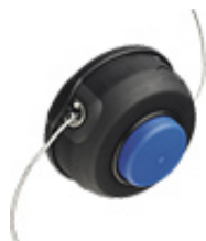
579 29 40-01 Trimmer head T25B

The Li-ion battery provides long lasting power and top class performance.