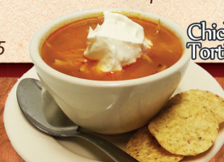
Chicken Tortilla Soup

BABY GREEK SIDE SALAD Feta cheese, tomato, beets, chick peas, kalamata olive, onion and pepperchoni on top of a bed of lettuce. 3.64