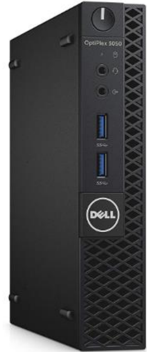
PC hardware not included