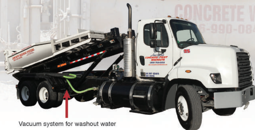
Vacuum system for washout water