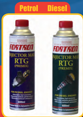
RTG Injector Max Fluids