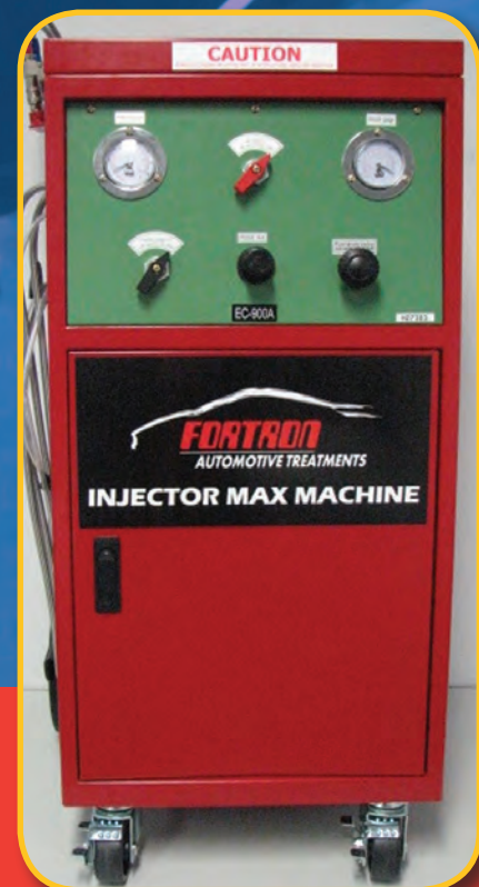
EC-900A-Injector Max Machine