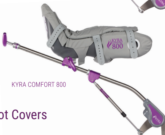
KYRA COMFORT 800