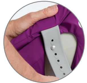
DURABLE SILICONE STRAPS