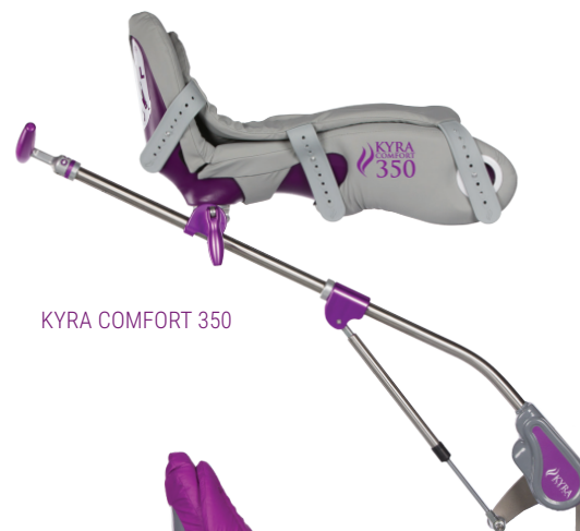
KYRA COMFORT 350

Ask your KYRA rep about our stirrups with integrated clamps.