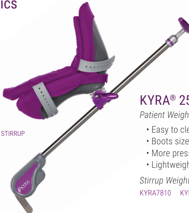
KYRA 250 STIRRUP