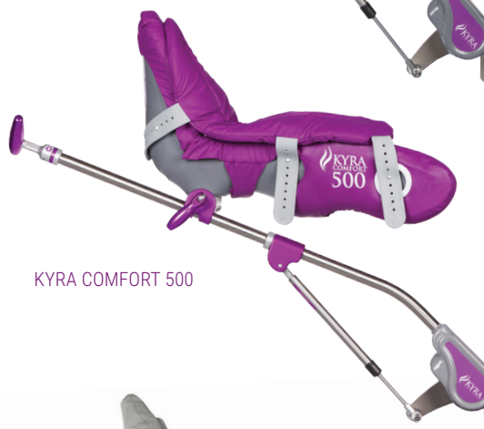
KYRA COMFORT 500