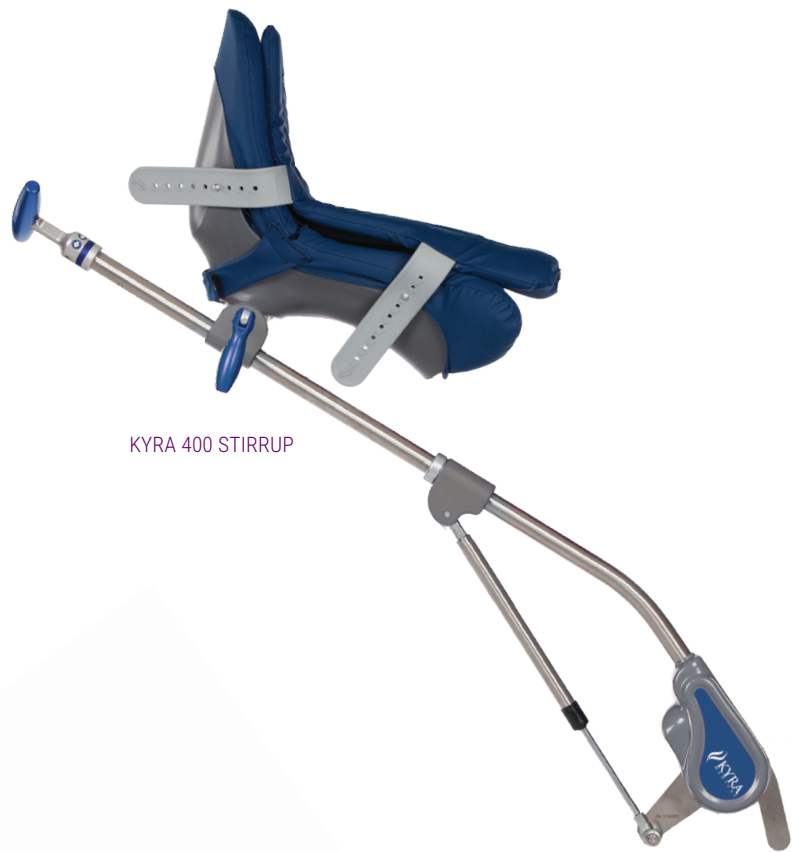
KYRA 400 STIRRUP

KYRA7100 KYRA 400 Stirrups w/ Secure-Lok™ silicone straps