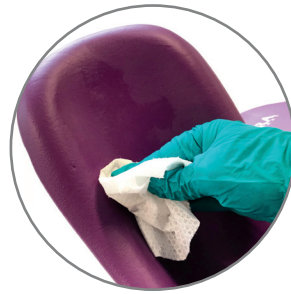
OPTIONAL EASY TO CLEAN SEAMLESS WATERPROOF PADS