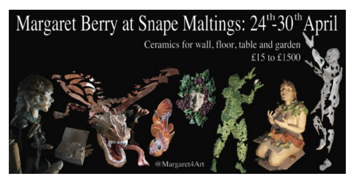
She specialises in suspended sculptures such as a ten-foot flying dragon

Full catalogue on www.MargaretBerry.com 17<sup>th</sup> April.