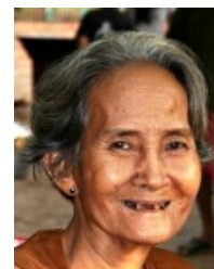
Happy in old age?

At NHS we believe our members should enjoy more comfortable, secure and fulfilled living with long-term solutions to cope with ageing disabled and disadvantaged family members. Most do not have state social service benefits in Cambodia, some have very small ones, so by tradition we rely on our younger generations. We have to create new opportunities for them to fulfill their obligations while leading their own full lives.