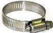
Stainless Steel Construction

20% discount on orders of 20 or more clips assorted size