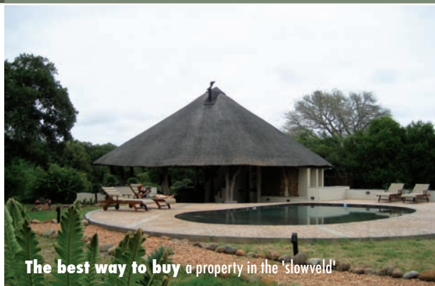
The best way to buy a property in the 'slowveld'