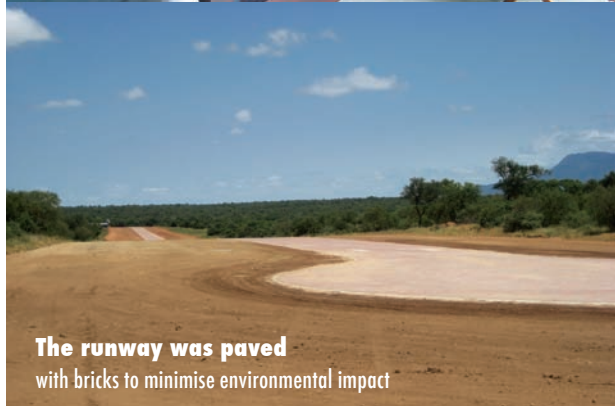
The runway was paved with bricks to minimise environmental impact

T O be able to experience the actual quality of life in Zandspruit, we were invited to spend a few nights at their lodge on the Aero Estate.