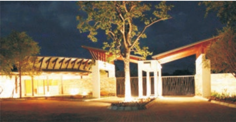
Zandspruit gate house

The OPP Awards were presented at a glittering gala dinner which took place in October this year at The Brewery in The City of London and created fantastic networking opportunity with the very best food, drink and entertainment.