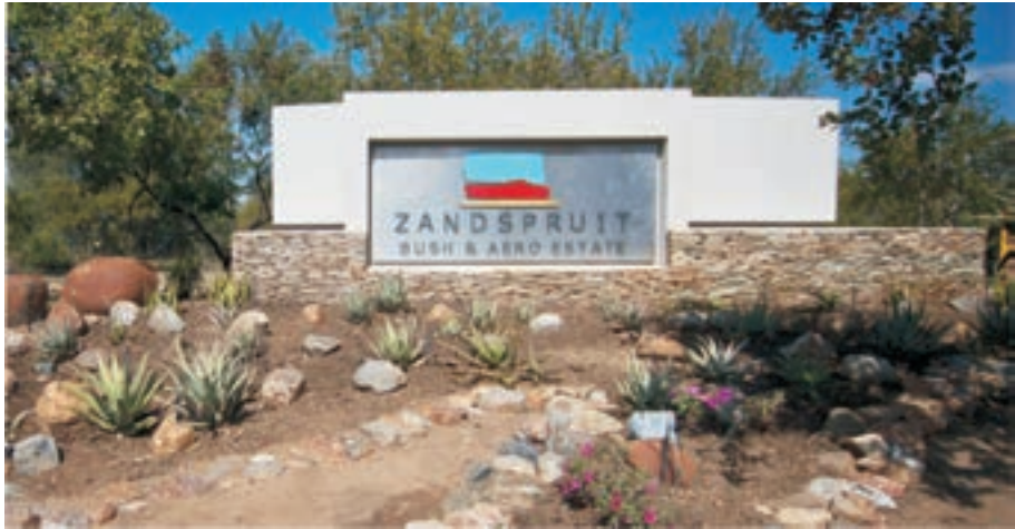
Zandspruit Bush and Aero Estate

is a vast 1000ha estate. Of the 1000ha, 350ha has been demarcated for residential development of true African bush homes. Among the development projects is the 5 star Hotel and the Equestrian Centre. The balance of the farm, comprising of 650ha of land is left as an untouched wilderness area where residents can enjoy a game drive, horse ride, cycle or sunset picnic. There are 200 stands that make up the Bush and Aero Estate of which 38 stands are specific aero stands located along the 1000m hard surfaced runway. These stands also give you the option of building your own hangar next to your home so that you can arrive at Zandspruit Bush and Aero Estate in your own plane, and hangar it right next your bush home.