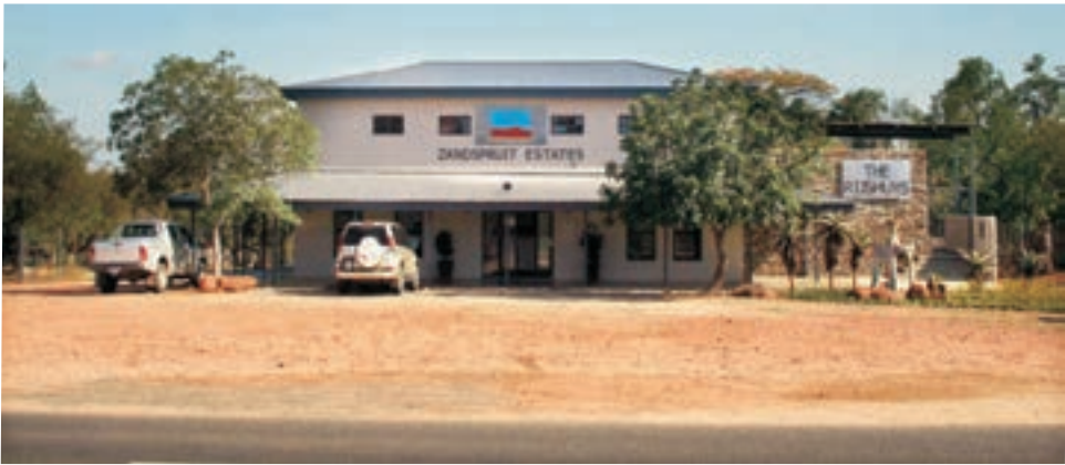
Zandspruit Estates office