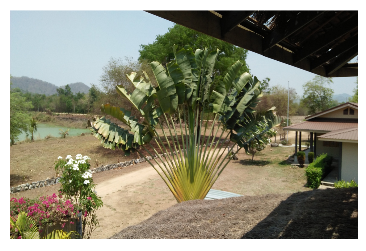
Grounds and Lake