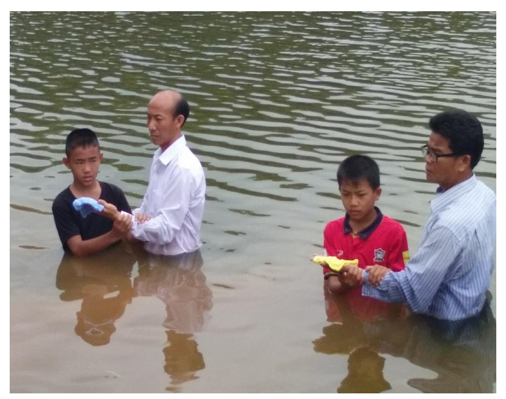
Sulads are influencing lives in Southest Asia