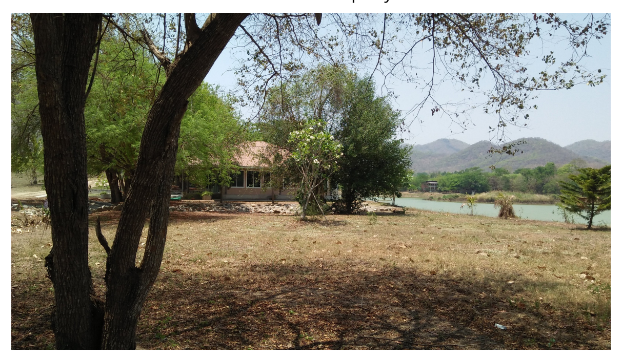
Grounds and Lake