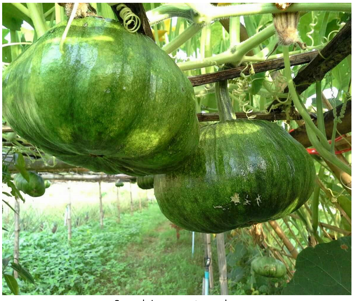
Squash in property garden