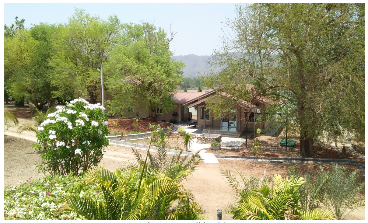
Conference Hall building