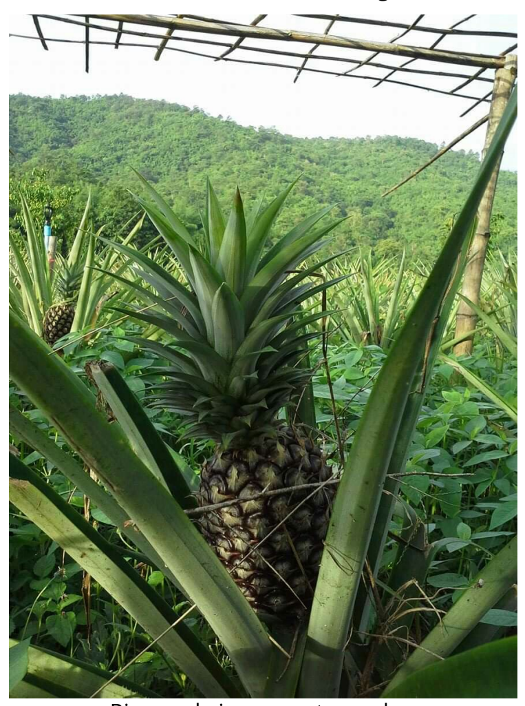
Pineapple in property garden