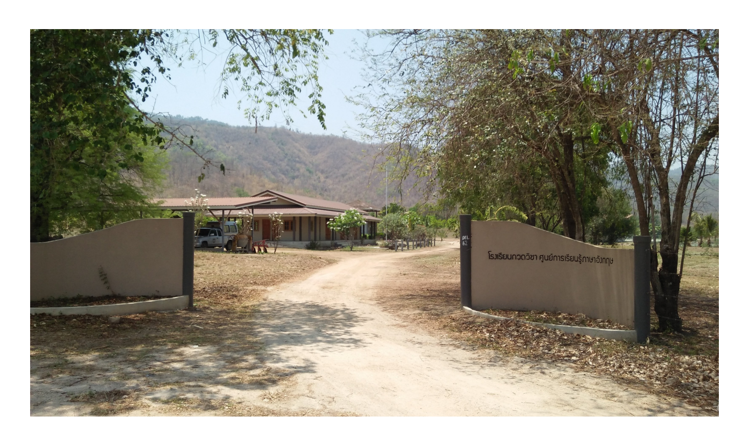
Entrance to Property