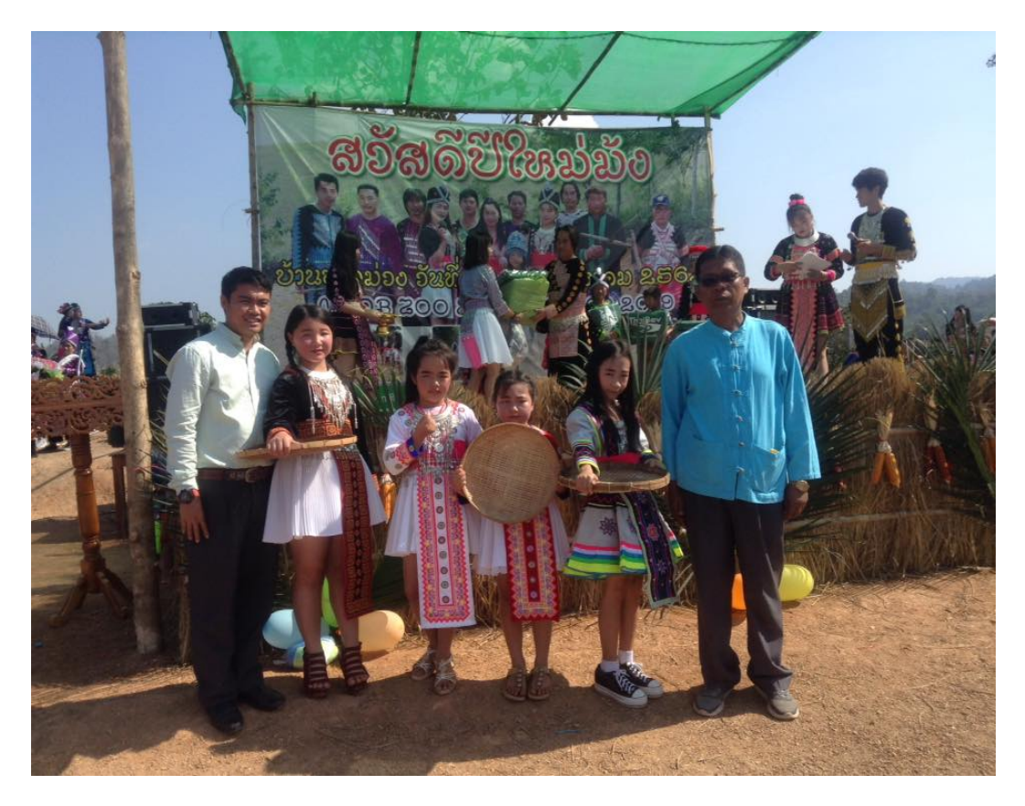
Sulads at work in Thailand