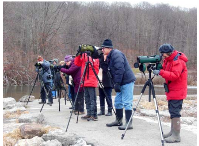
CBC participants at Moraine