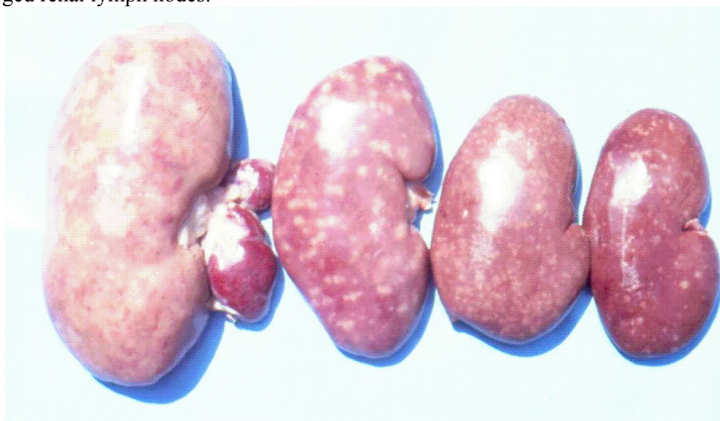
Figure 1. Range of enlargement and mottled or pale appearance of kidneys from pigs with MPN at age of 6-8 months taken at slaughtered time, including an example (left) with enlarged renal lymph nodes.

It is important to mention that kidney damages in spontaneous MPN in Bulgaria (Figure 1) are more similar to those in Balkan endemic nephropathy (BEN) in humans, than in Danish MPN. For example, the fibrotic changes and contraction of kidneys in the end-stages of MPN in Bulgaria are very comparable to those in BEN in humans [1], whereas such changes are not seen in the classical description of MPN as made in Denmark. In addition to the contraction of kidneys in later stages of Bulgarian MPN and BEN, there are various other similarities between BEN in humans and Bulgarian MPN as the low contamination levels of OTA in feeds or foods and serum, neoplastic changes in kidneys (pigs – Figure 2) or urinary tract (humans), retention cyst formation in proximal tubules of kidneys, vascular lesions in kidneys, electron dense formations and myelin-like figures in mitochondria of epithelial cells (Figure 3). However, these pathological changes have not been observed in classical MPN as described in Denmark or elsewhere. This circumstance, in addition to low feed/food levels of OTA in Bulgarian MPN and BEN, suggest a possible interaction between OTA