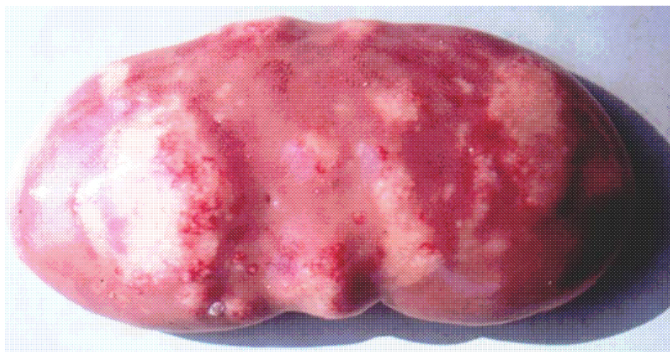
Figure 2. Kidney with neoplastic tissue (fibroadenoma) - spontaneous case of MPN in Bulgaria.

All feed samples originating from farms with high frequency of spontaneous avian nephropathy in Bulgaria were also positive for OTA and similarly to pig farms, the levels of OTA were substantially low (the values ranged from 90.8 to 310 ng/g (mean 196.2 ng/g \pm 45.9). The nephropathy in chickens was usually observed during the spring and summer, similarly to porcine nephropathy and in the same regions as well. The occurrence of nephropathy in different batches of slaughtered chickens varied from 1-2 per cent up to 90-100 per cent. The continuance of this nephropathy, also differed widely from one month to about 5-6 months or even throughout a year [23].