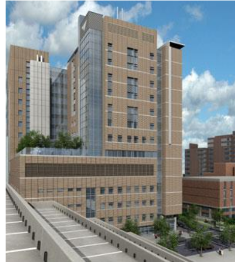
Smilow Cancer Hospital in New Haven, Connecticut

Smilow Cancer Hospital Wins Green Building Award