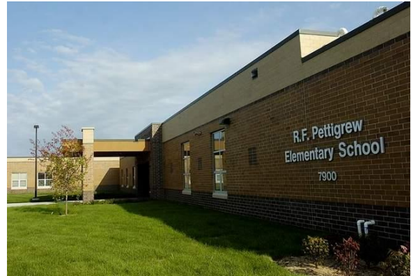
R.F. Pettigrew Elementary School in Sioux Falls

Next Newsletter: Friday, August 12, 2011