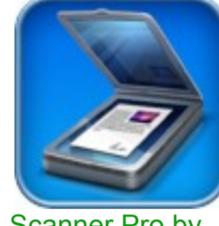
Scanner Pro by ...