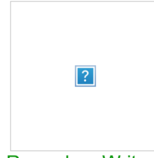
Remarks - Write...