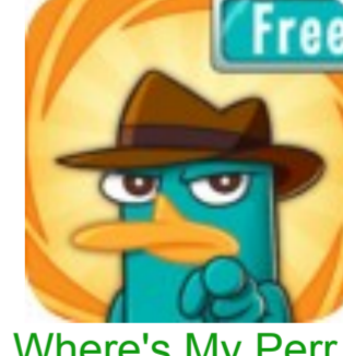
Where's My Perr...