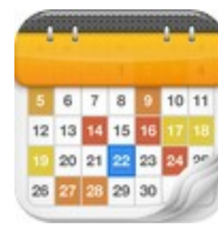
Calendars - Goo...