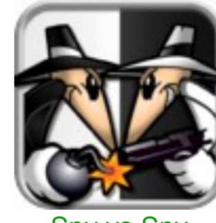
Spy vs Spy