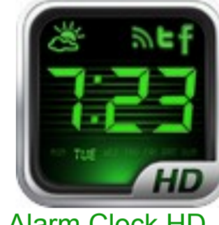
Alarm Clock HD ...