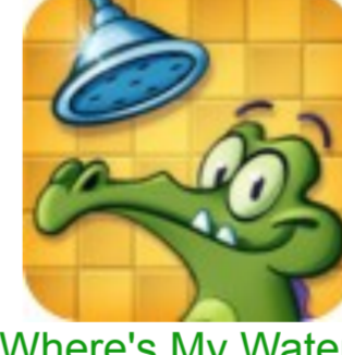
Where's My Water?