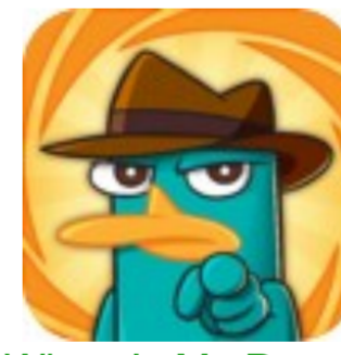
Where's My Perry?