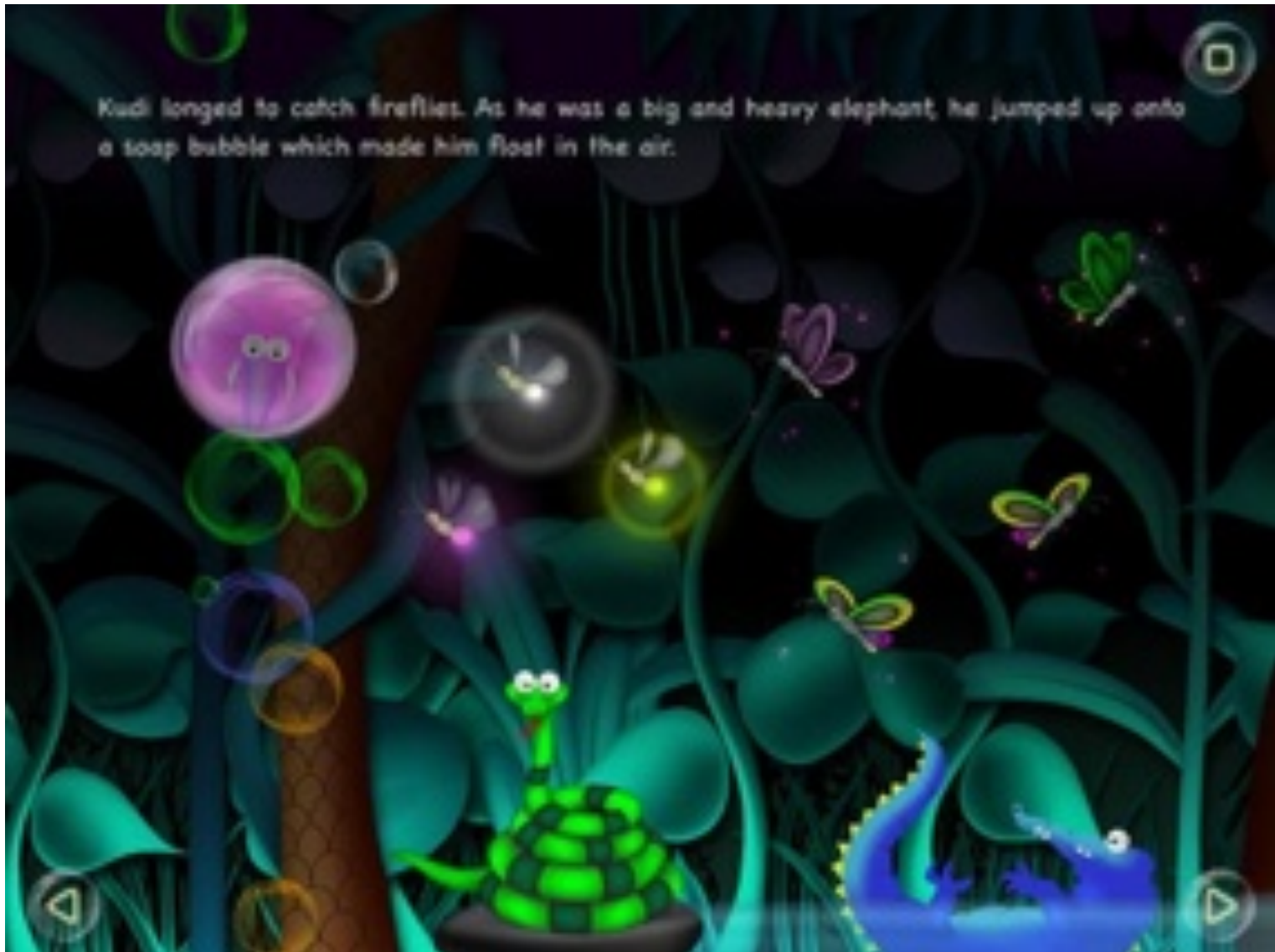
These four animals get into all kinds of mischief.

Each page contains an interactive element, allowing the users to "play" with the scenes (usually through animation and/or sound). These interactive elements on the pages do not really change the story in any way, as they tend to be simple noises and visual gimmicks. However, there are some pages that offer some enhancements to the telling of the tale, so it is important to make sure that you interact with each page. The final set of pages in the eBook are the cornerstone of the educational portion of the app, showing the configuration of some of the more well-known constellations; the background story of each of these constellations is also revealed, giving the readers a lot of interesting information in an entertaining fashion.