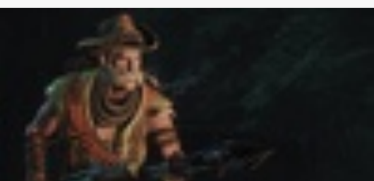
REVIEW: EVOLVE »