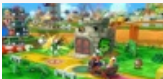
REVIEW: MARIO PARTY 10 »