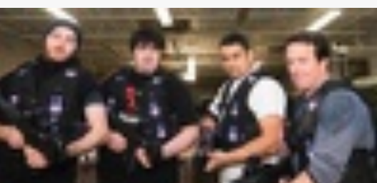
IMPRESSIONS: BATTLEGROUND'S »