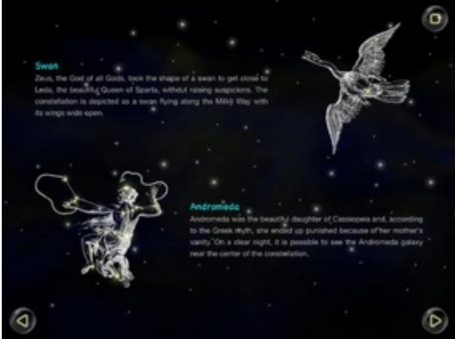
The constellations that are present in the game are explained very well.