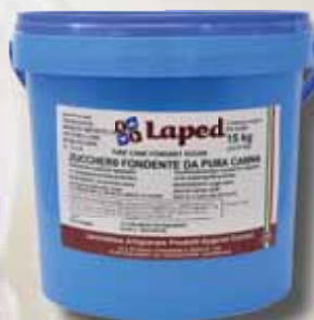
LA97197 Fondant Cream White Icing Tub (Pure Cane) 1/15 kg/cs $46.69