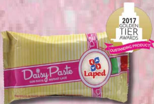
LA84102 Daisy Gum Paste (Instant Lace) 10 x 0.5 kg/cs $78.13