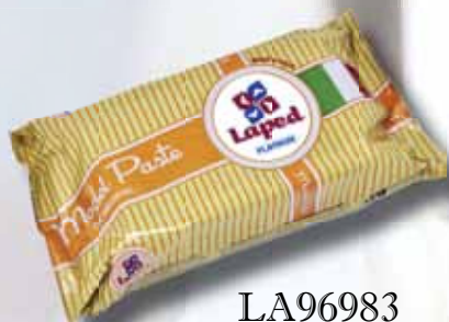
LA96983 Model Paste White 1/5 kg/cs $65.00