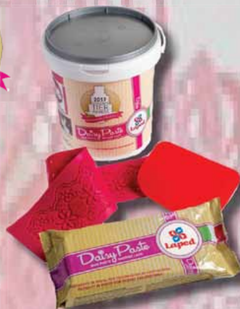
LA84103 Daisy Starter Kit {1 Gum Paste + 1 Mold (Random) + 1 Scraper} 1/1 Kit/cs $26.07