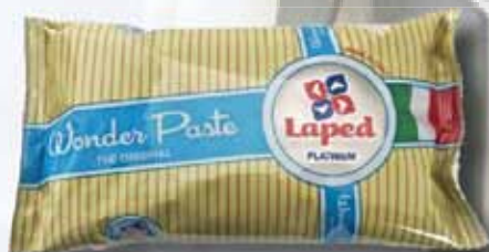
LA96980 Wonder Paste White (Rolled Fondant) 1/5 kg/cs $38.40