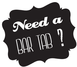
PLATE IT UP