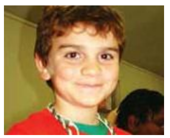
"Every time I come here, I have the best time of my life. I am happy every time my mom says I'm going to camp." – Boy, age 10