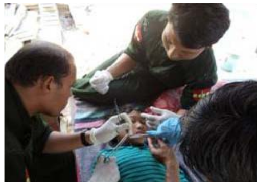
A small boy in Myanmar having bamboo splinters removed from his face after the earthquake.

There is an ongoing need to help the victims of this "unreported" disaster. If you would like to give, please use the enclosed Response form and indicate your gift is for the Asia Disaster Relief fund. 100% of donations received go directly to the need. Nothing at all is deducted for administration or any other expense. We cover all such costs ourselves.