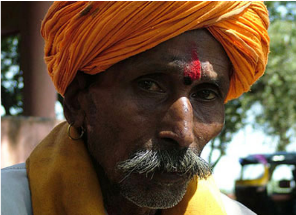
A Hindu priest who has yet to meet Jesus.

We are now experiencing growing opposition from Hindu activists, who are furious that I tell the people, "Jesus is the only way to be saved!" By the grace and power of God, however, I plan to continue my ministry and do whatever I can to make our new believers strong in the Lord. Please pray for us, and thank you for your generous partnership in the Gospel.