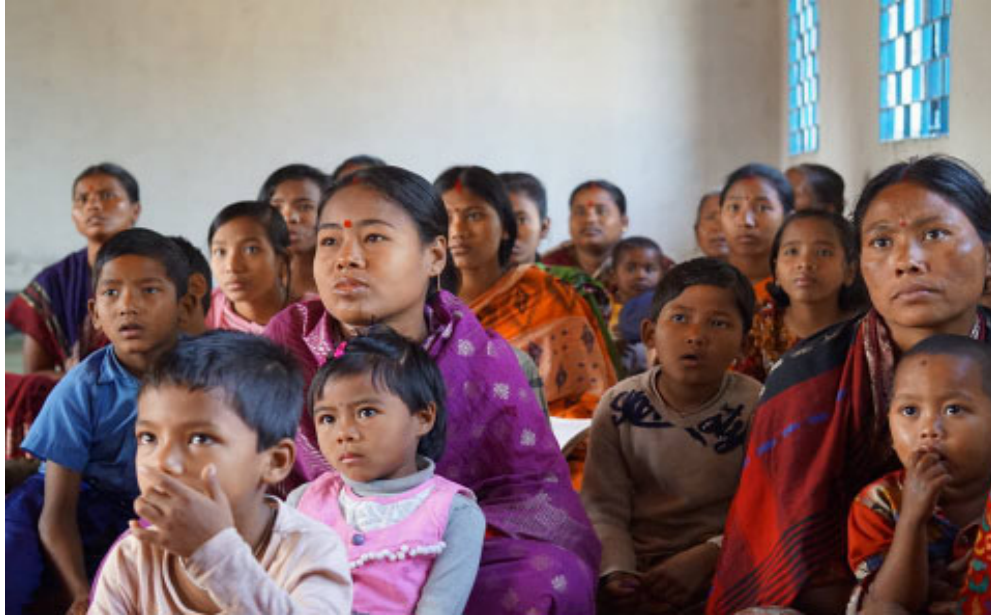
Women and children in Bangladesh eagerly listening to the gospel from one of the evangelists we support through the Asian Workers' Fund.

Because of your prayers and partnership we ended 2019 supporting 1,349 Asian missionaries, serving among 1,038 unreached people groups. A reported 100,188 people experienced God's salvation last year.