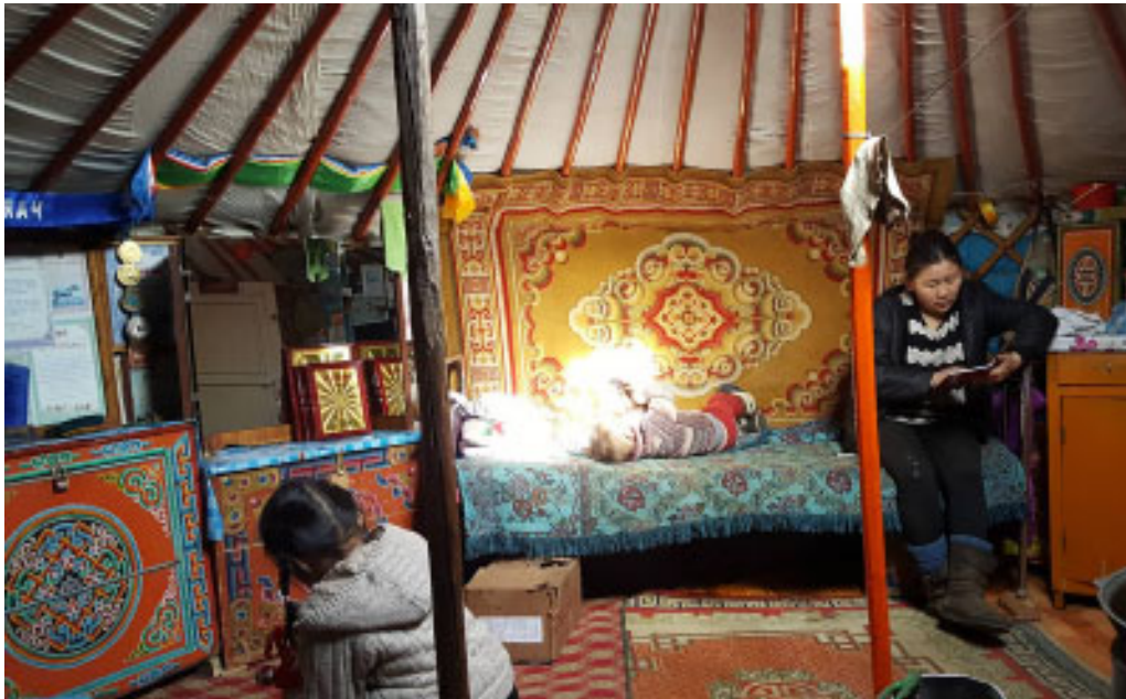
A Mongolian mother reads the Gospel for the first time inside her family's yurt (tent).

Because of your prayers and partnership, we ended 2020 supporting 1,484 Asian missionaries, serving among 1,132 unreached people groups. A reported 117,509 people experienced God's salvation last year.