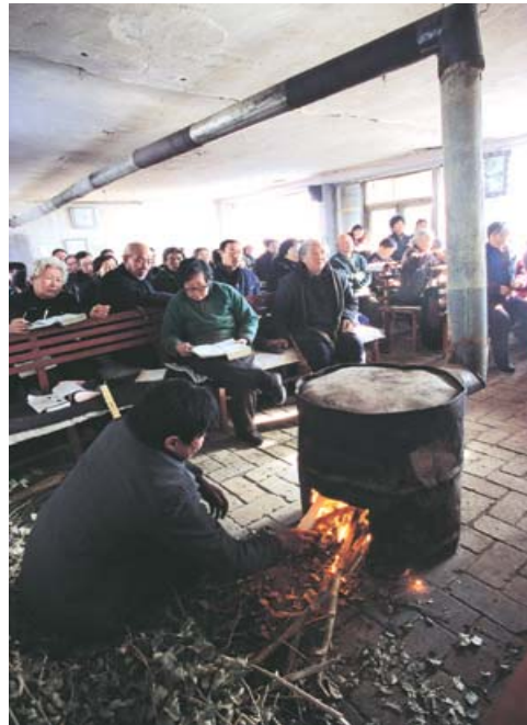
A man stokes a fire to keep the congregation warm during a winter church meeting in Heilongjiang.

We realize that without the prayers, encouragement and support of caring Christians our efforts would be in vain. We don't get many opportunities to speak in churches outside Asia very much, as we believe God wants us to focus on ministering here in Asia and He will provide whatever we need to do His will. Therefore our newsletters are the main way we communicate our vision to Christians around the world, and so we greatly appreciate you taking the time to read them. We thank God for your partnership. "The share of the man who stayed with the supplies is to be the same as that of him who went down to the battle. All will share alike." (1 Samuel 30:24)