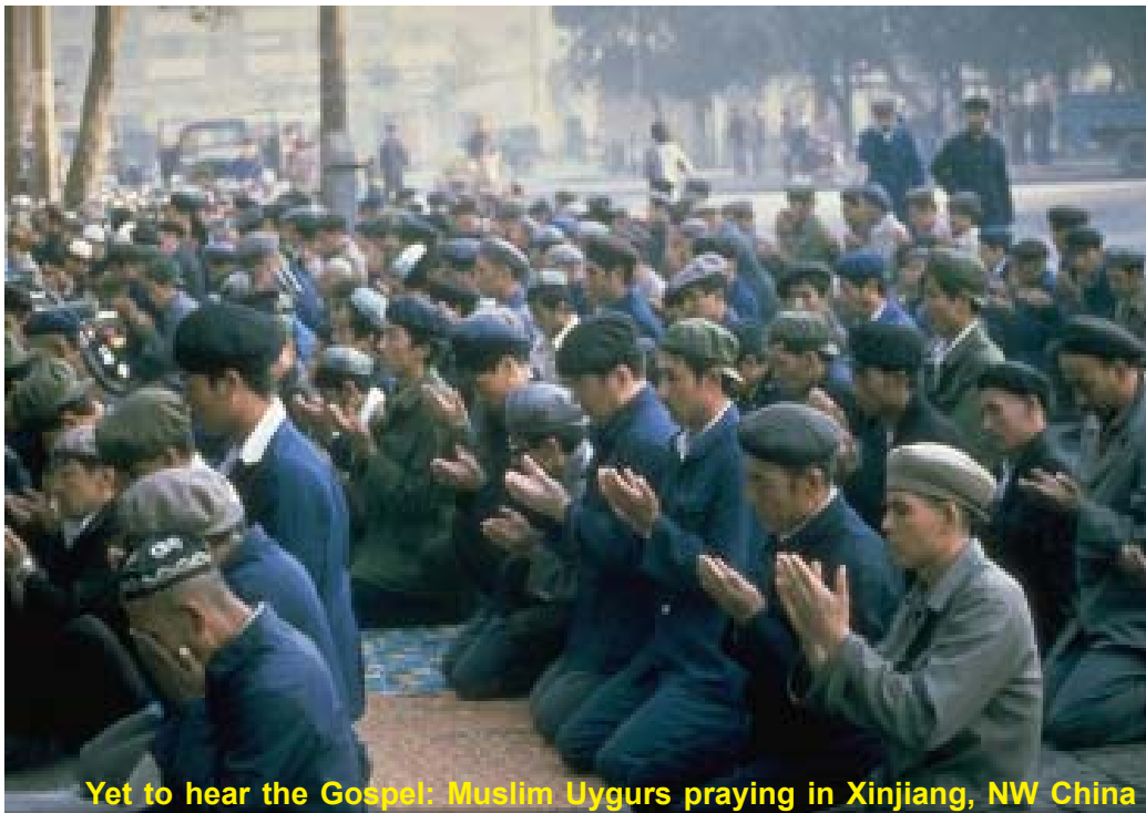
Yet to hear the Gospel: Muslim Uygurs praying in Xinjiang, NW China

Surely this is how many of the Muslim, Buddhist and Hindu nations feel today! They are sure that they have the truth, and are so