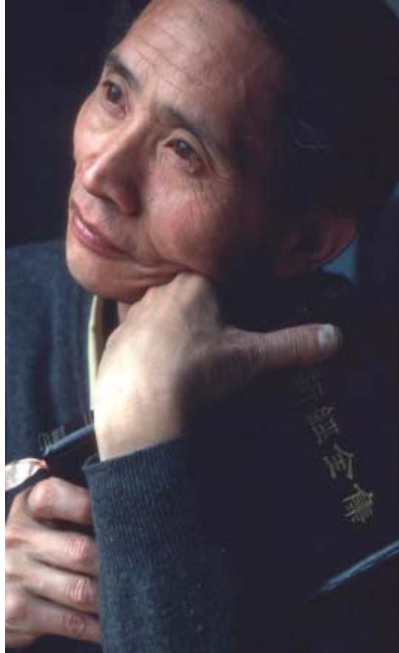
A Chinese pastor clutching his Bible.

In this issue we would like to examine the overall story of Bibles in China. We hope it will be helpful and informative to you.