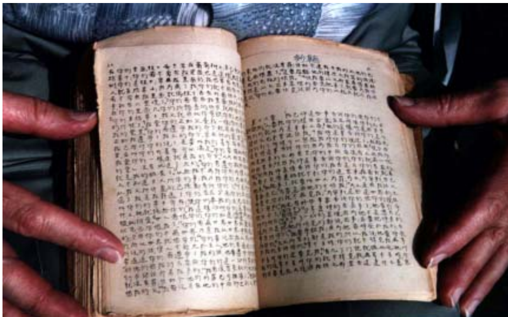
A hand-copied Chinese Bible from the 1970s

As the 1980s got underway, the church in China to increase in number but Bibles