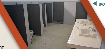
Improved restrooms for men & women