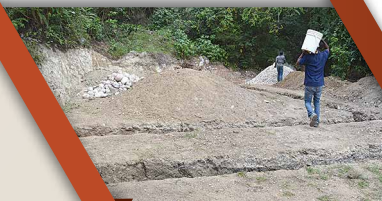
▲ Construction underway – new school for missionary children