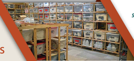
◀ New central supply – Improved inventory control