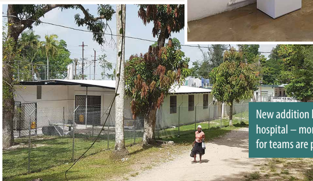
New addition benefits the hospital – more projects for teams are planned

The new addition will make both the laundry and housekeeping departments more efficient and free up space for other uses. The area previously occupied by housekeeping will be used for a badly needed patient bathroom area, allowing 6 new toilets, and 4 shower stalls to be added. And the old laundry area will now be used as a central supply depot, doubling the storage space for hospital supplies. The additional space will allow more supplies to be shipped in by sea container, which is 50-70% cheaper than buying them in-country.