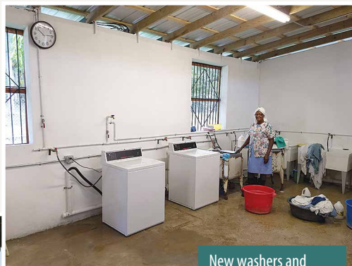
New washers and dryers increase capacity and efficiency

Another improvement facilitated by the team was all new washers & dryers. The new machines have greatly increased capacity, allowing the hospital to launder surgical gowns rather than using disposable gowns.