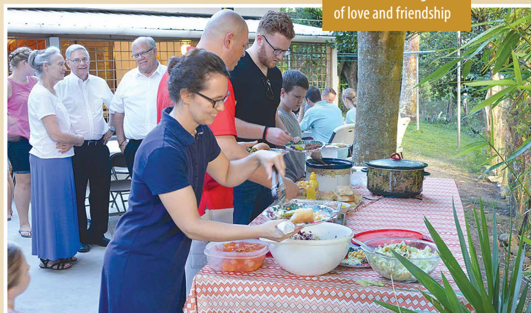
Enjoying a potluck dinner – forming bonds of love and friendship

Your continued prayers are vital. Prayers are very much needed and very much appreciated. Please pray for the wellbeing of our missionary families and that Jesus Christ can be glorified through their work at Hospital Lumiere.