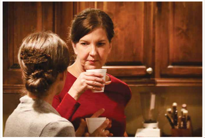
Show genuine interest without overwhelming them

– As it is in connecting with anyone who has been through a significant experience, we realize that answering everyone's questions in many separate conversations can quickly become tiresome and overwhelming. There will be times when all a missionary may want to do is chat or simply sit with someone and take a break from