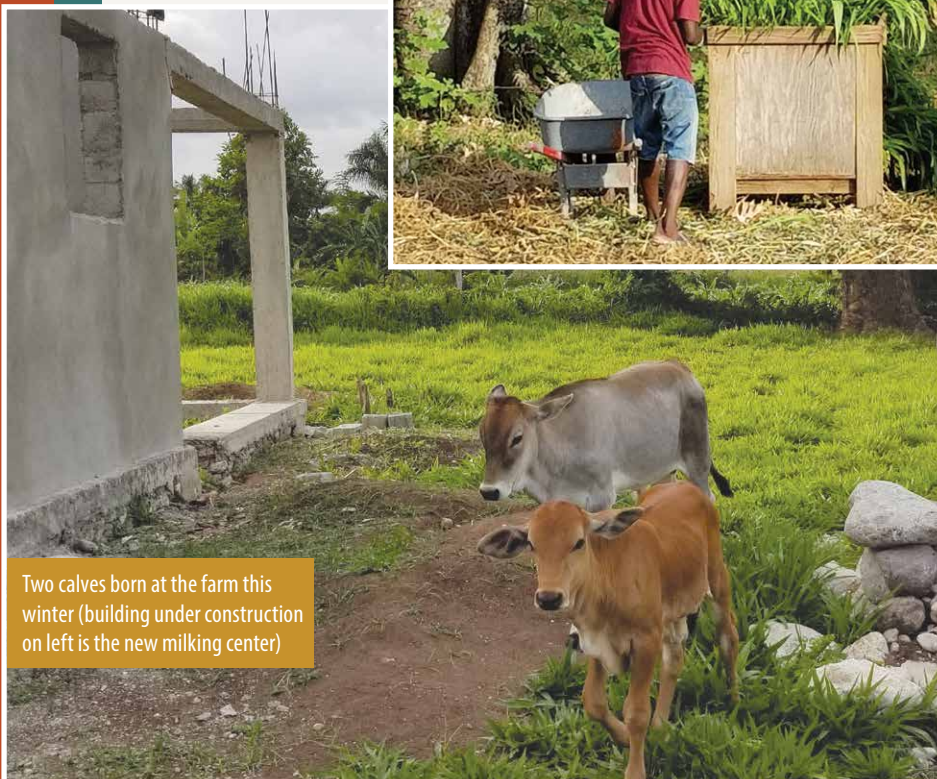
Two calves born at the farm this winter (building under construction on left is the new milking center)

There is still significant interest in shipping US cattle