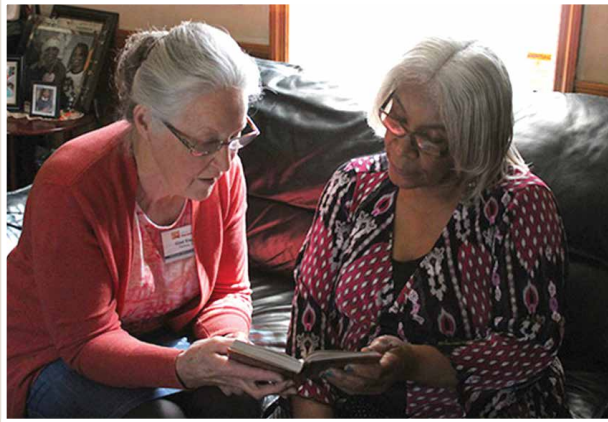
Initiating a spiritual conversation

Couples continue to pray with CEC members about where God might be directing them to plant a new church or bolster an existing small church. Additionally, several Apostolic Christian churches are considering cell divisions. As we wait on God's direction in these areas, the Church Establishment Committee continues to work with the existing churches of Lamar, MO, and Kitchener, Canada, to bolster their congregations. Currently these churches are establishing "visions" for their future growth and outreach into the community. For Lamar, pray that the Holy Spirit would move in the hearts of families, couples and singles to relocate to help "build up" this small flock. Those with gifts in the areas of evangelism, Sunday School teachers, song leaders and ministers are especially needed.