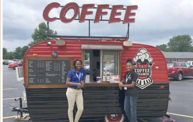
Deaf Can! baristas provided coffee at Proclaim & Serve 2018

And while this growth is encouraging, we desire your prayers most for fruit to bear out in individual lives and souls. Pray for the young men and women who occasionally gather together on a Sunday to spend time in fellowship and Bible study. Pray for thirsty souls to be watered and to find that there springs an eternal well of Living Water when we are tapped into the Root of Jesus Christ.