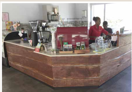
Coffee counter at a Toyota dealership

in his image, and it doesn't matter that they are Deaf and different from the majority of the hearing world, they are still called to bear fruit. The business is now employing over a dozen Deaf young adults and has successfully planted a small coffee farm at the Knockpatrick campus of CCCD.