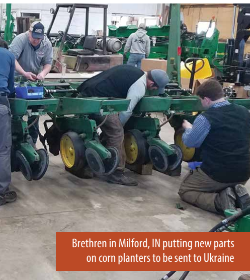
Brethren in Milford, IN putting new parts on corn planters to be sent to Ukraine

The brethren in Ukraine continually show their appreciation for all of the fellowship, prayers and support HarvestCall is giving. One of the ways they demonstrate this is in their youthful singing. Even though there is a language barrier, we feel a kindred spirit as we sing the familiar Zion's Harp melodies together. For more than 150 years, these hymns have been a part of our worship service and our heritage, but in some areas, the Zion's Harp was difficult to access