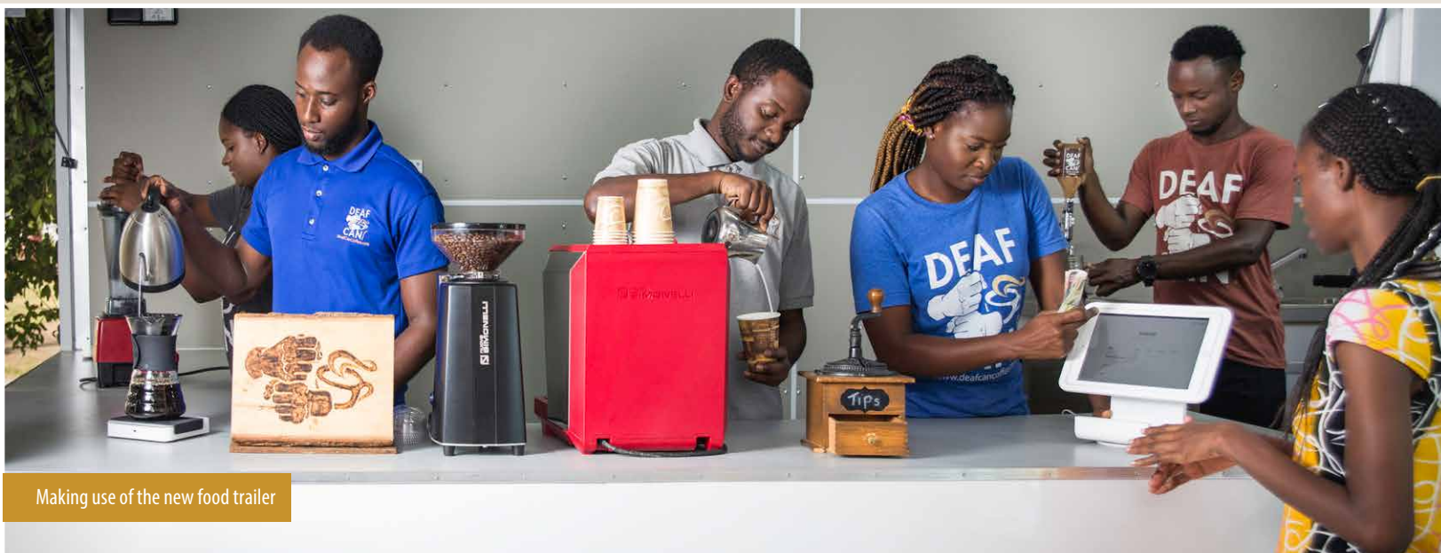
Making use of the new food trailer

STAY CONNECTED | Prayer support is needed in every part of HarvestCall work. Here are two ways to learn about projects, how to be involved and how to pray specifically.