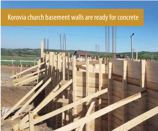
Korovia church basement walls are ready for concrete

In Ukraine, there are many young people embracing the faith of our forefathers in spite of pressures around them. But these growing churches need places to worship. Financial support from HarvestCall is helping fund a new building in Korovia, where construction began this spring. When the HarvestCall European Committee traveled to Ukraine, they witnessed many people working on forming and pouring the concrete basement walls. Lord willing, as churches are built and remodeled it will allow the congregations to continue to grow as they have many large, young families.