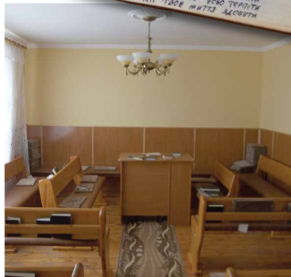
Church in Khyzha where they use hand-written Zion's Harps

due to trials brought on by poverty, border restrictions, and oppressive governments. In Ukraine, where various dialects, languages and mountains separate the brethren from each other, by God's grace, they found a way to preserve the Zion's Harp by hand copying them into a notebook, daily planner, or whatever other types of paper books they could get. This would take up to a year of dedication to accomplish. When the churches were closed and they gathered in secret, it was some of these hymnals that the brethren softly sang from to encourage one another. Today, these hymns are just as alive and carry just as much meaning as they did to the brethren back then. Almost all of the congregations in Ukraine now use printed Zion's Harps, but not all. Speaking to