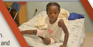
◀ Haiti has the highest infant mortality rate in the western hemisphere