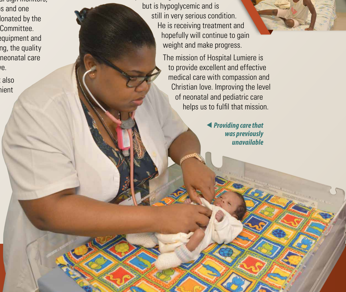
◀ Providing care that was previously unavailable

The mission of Hospital Lumiere is to provide excellent and effective medical care with compassion and Christian love. Improving the level of neonatal and pediatric care helps us to fulfil that mission.