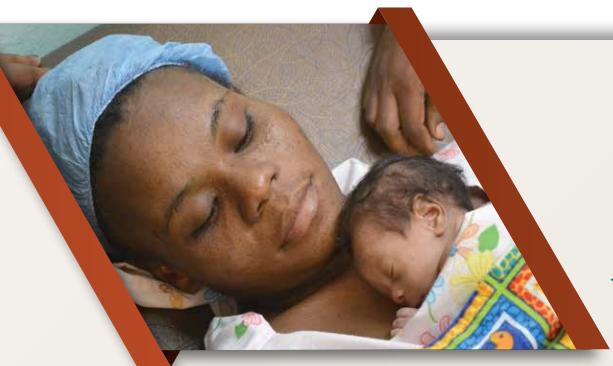
◀ Kangaroo care – contact increases chances of survival

Lumiere provide badly needed neonatal care that was previously unavailable in Southern Haiti.