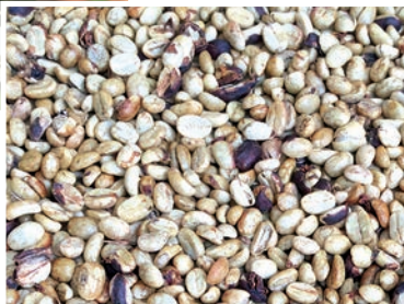
Harvested coffee beans, before roasting ▶

come forth a rod out of the stem of Jesse, and a branch shall grow out of his roots: And the spirit of the Lord shall rest upon him, the spirit of wisdom and understanding, the spirit of counsel and might, the spirit of knowledge and of the fear of the Lord...and he shall not judge after the sight of his eyes, neither reprove after the hearing of his ears: But with righteousness shall he judge the poor, and reprove with equity for the meek of the earth.