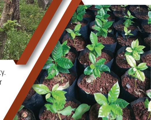
Coffee plant seedlings ▲