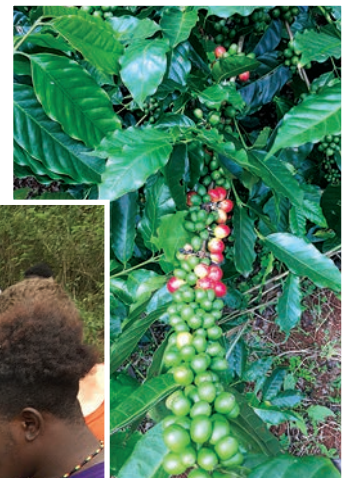
◀ Picking ripening coffee cherries