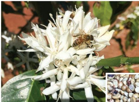
▲ Plant blossoms