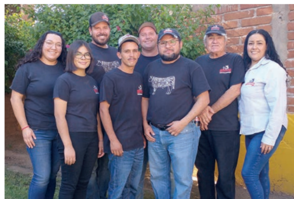
Carnísimo and Carnísimo Burgers 2020 employees ▲