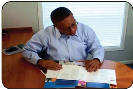
Thoroughly read insurance plans

Even though most plans pay only for basic services, we believe that you should be able to choose the most appropriate dental treatment for you and your family.