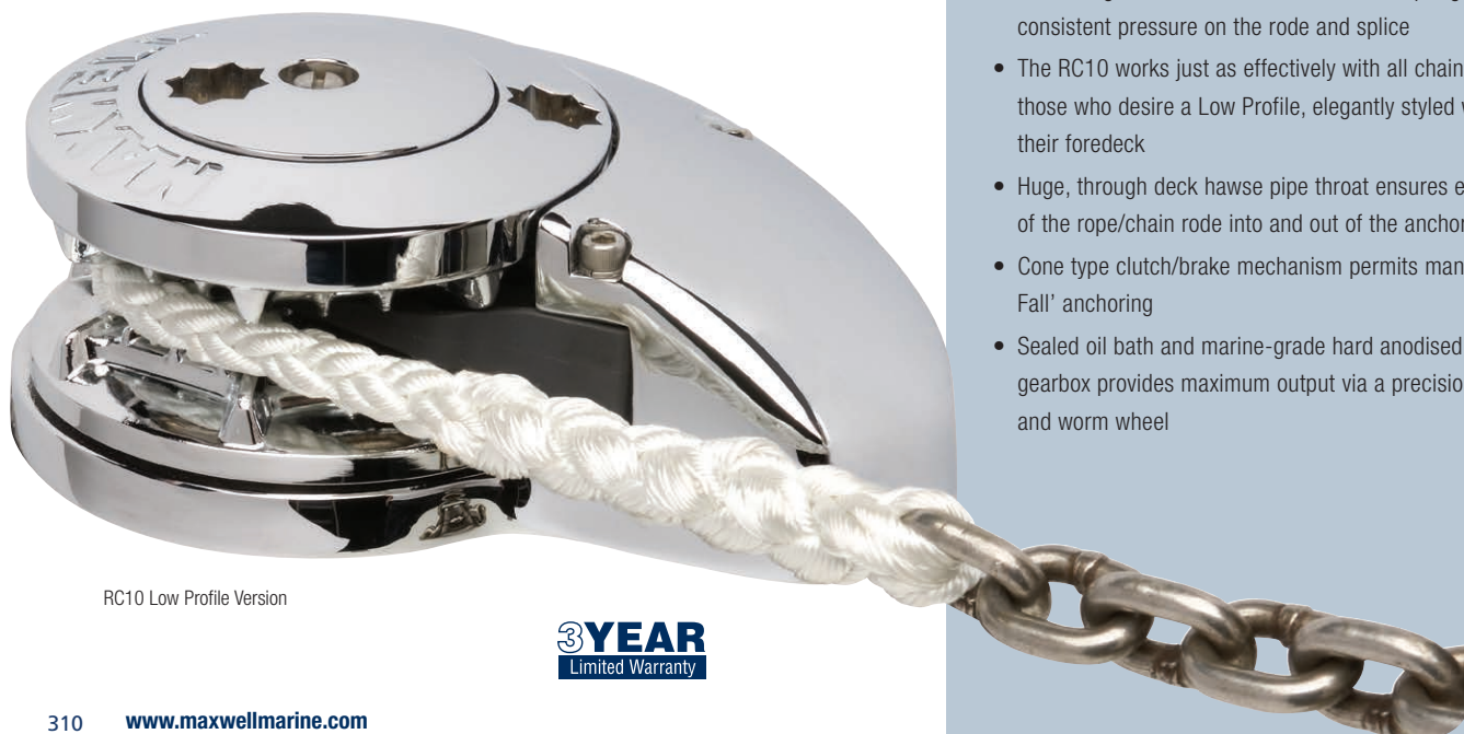
RC10 Low Profile Version