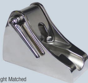
Height Matched Chain Stopper