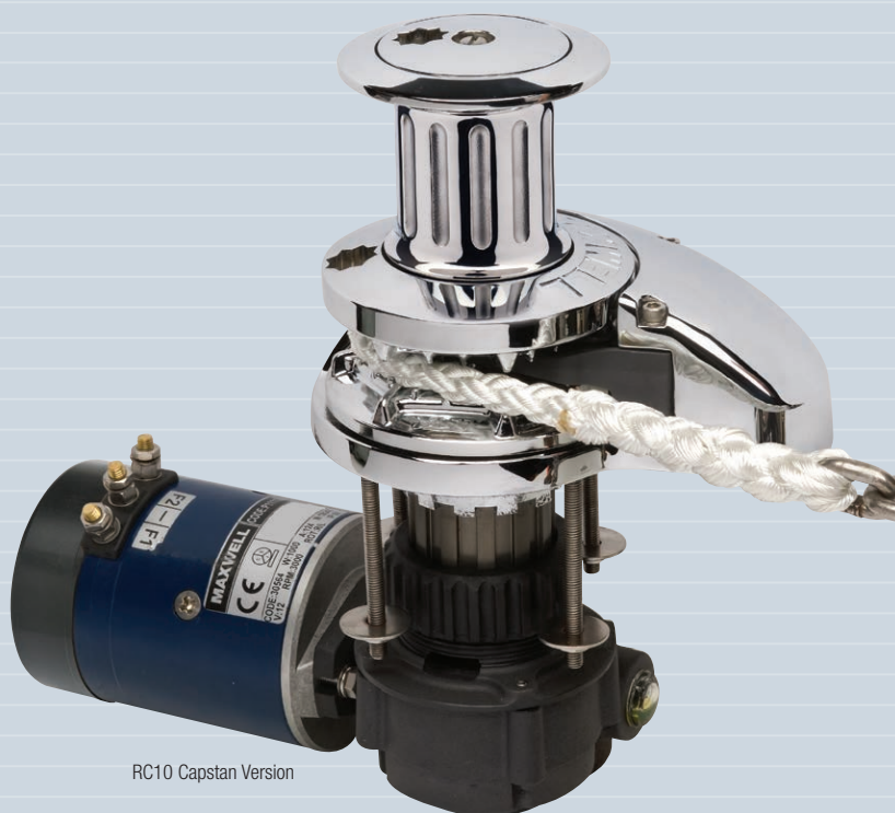
RC10 Capstan Version