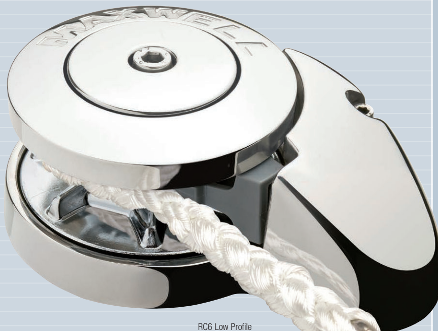
RC6 Low Profile

The stainless steel (AISI 316) RC6 automatic rope/chain anchor winch is Maxwell's smallest version in the highly successful vertical RC Series Windlass Range.