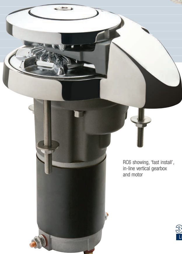
RC6 showing, 'fast install', in-line vertical gearbox and motor