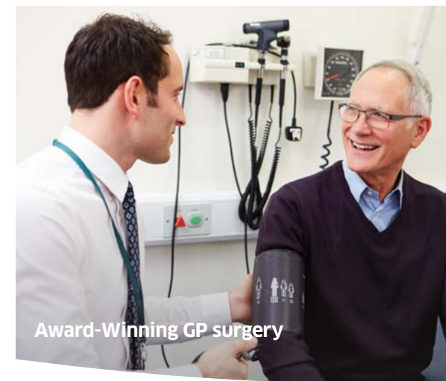
Award-Winning GP surgery

“For friendship, independence and the very best in care”