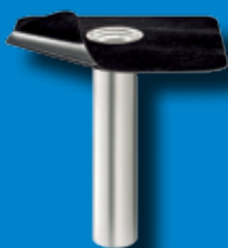
Depco bituminous outlets