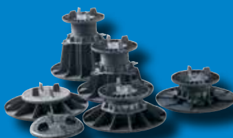
Soprema paving support plots

A full range of ancillary system components and accessories are available to compliment the Sopralene Flam 250 waterproofing systems, all of which are covered under the Sopracover Warranty.