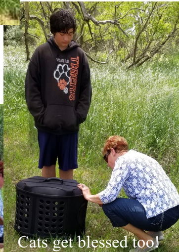
Cats get blessed too!