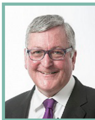
FERGUS EWING Cabinet Secretary for Rural Economy and Tourism

We would like to thank the members of the Task Force for their invaluable input and contributions over the summer to this report which reflects their expertise, understanding of the sector, and commitment to supporting tourism in Scotland.