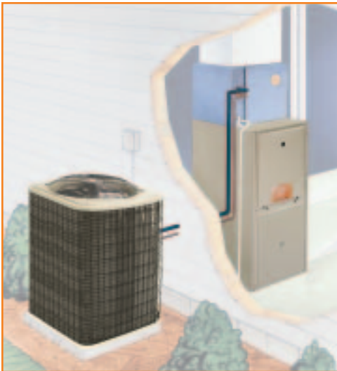
Air Conditioner and Gas Furnace System

An energy-efficient Payne furnace provides welcome warmth during winter's blustery chill. Add a Payne central air conditioner and properly matched evaporator coil and you can count on cool, soothing relief from summer's heat as well. It's a total system solution for indoor comfort you can count on all year long. And with the PG8MEA/PG8JEA you'll enjoy additional cooling efficiency during the cooling season.