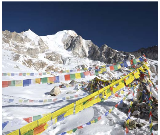
Larke Pass in Nepal

The Larke Pass is a passageway that used to provide access to these isolated villages before it was cut off by a landslide. Nuri and the crew worked for three weeks to get the Lark Pass open for supplies, then prepared mules for the long journey to bring WFP food to remote villages.