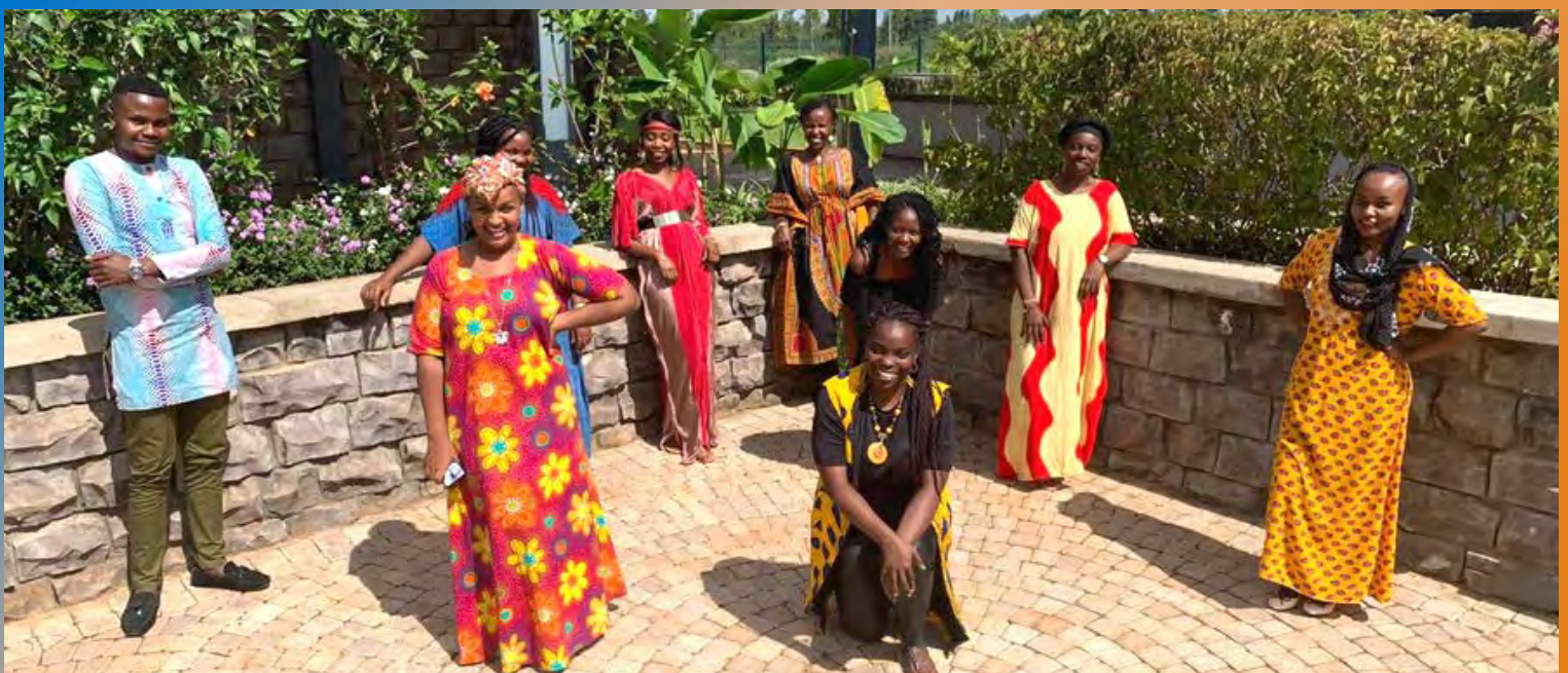
STAFF POSE FOR SWAHILI DAY