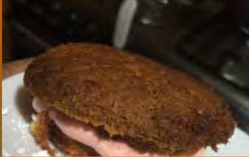
SCONES MADE BY FAITH, YR 5