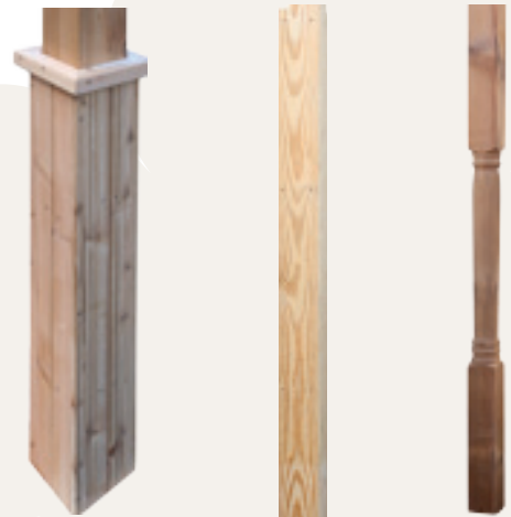
36" Decor Post Cover Cover