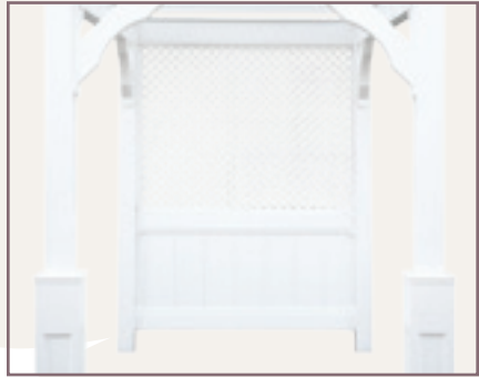
36" Privacy Wall with Lattice