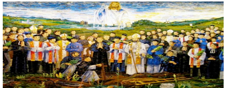
Saints Andrew Kim Tae-gon & Paul Chong Ha-Sang & Companions Martyrs