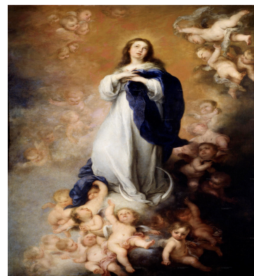
FEAST OF THE IMMACULATE CONCEPTION

All blood types are needed, particularly A & AB. Type O donors are especially needed as they are the universal donor. If you are a Type O or any negative blood type, please consider doing a double red cell donation. The Automated Red Cell Collection Process is available. Please speak to the technician and see if you qualify: 1-800-733-2767. Appointments are preferred. A blood donor card or driver's license or two other forms are needed at check-in. You may sign up in the back of church or at redcrossblood.org . Enter sponsor Keyword: pppnj. Our goal is 40 pints which means we must have at least 60 people sign up.