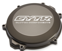
GYTR® Billet Clutch Cover