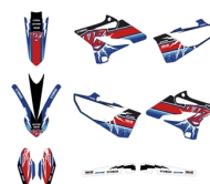
Sticker Kit YZ250