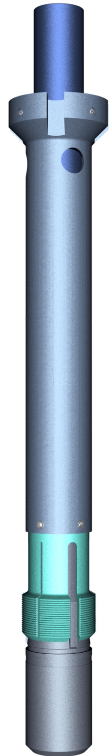
STT dressed for 9 5/8" Casing