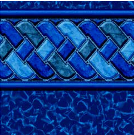
North Fork Creek Unibead 48", 52", 54"

20 Yr. Limited / 3 Yr. Full Warranty with the Extended Warranty Protection