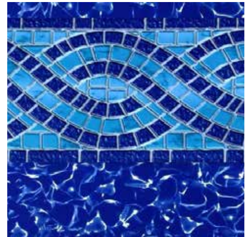
Willow Creek Unibead 48", 52", 54" / *Esther Williams Bead