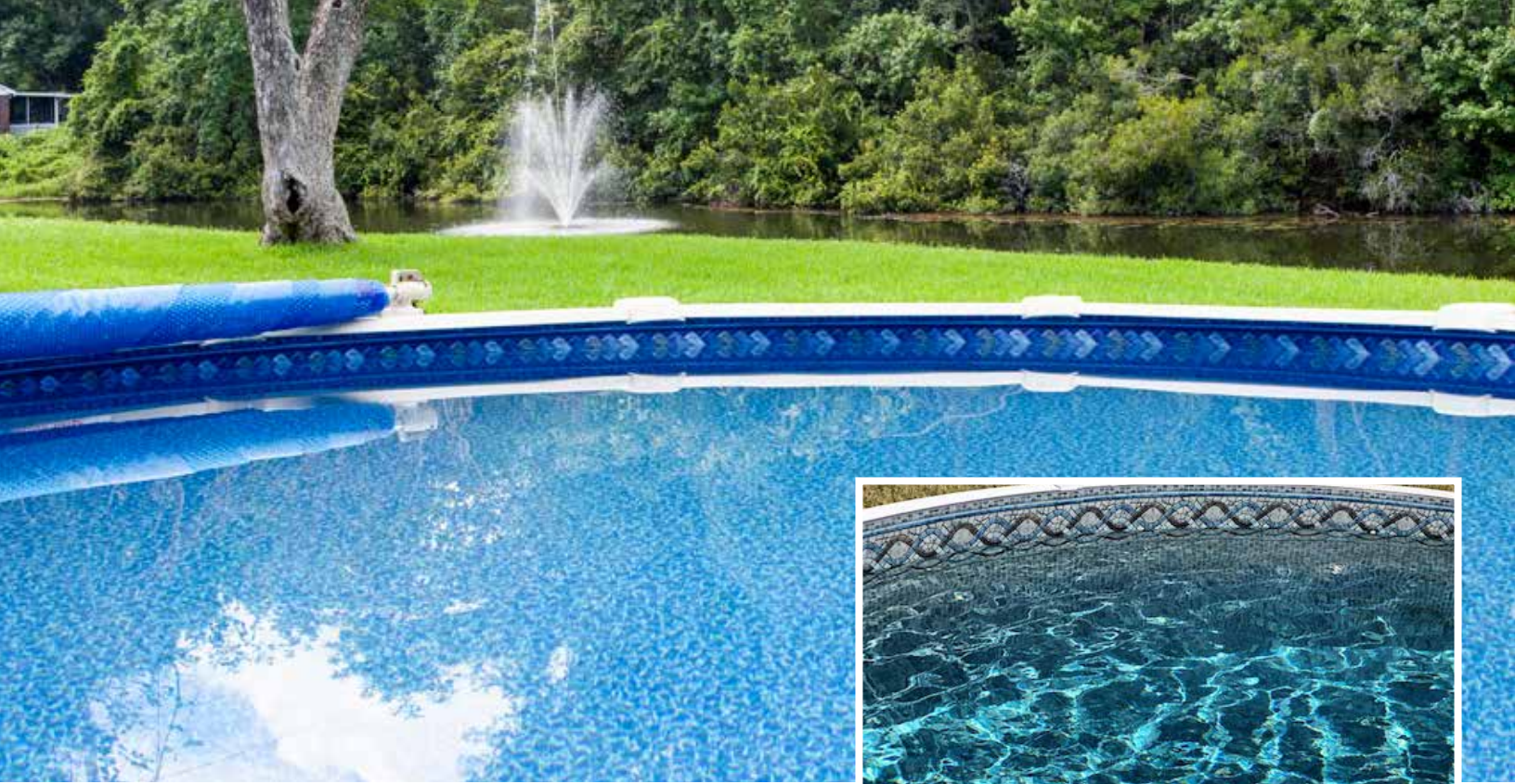
Liner Shown: Breeze Creek