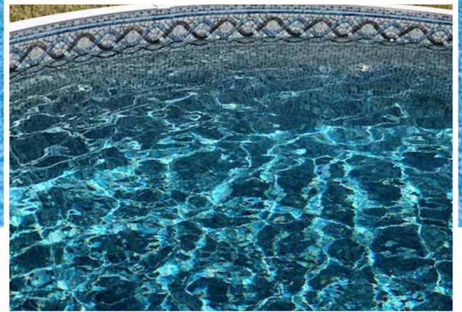
Liner Shown: Platinum Creek