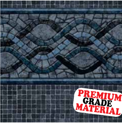
Platinum Creek Unibead 48", 52", 54"

25 Yr. Limited / 5 Yr. Full Warranty with the Extended Warranty Protection