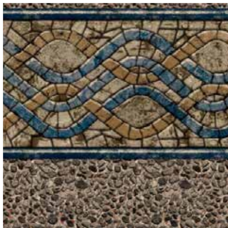
Gold Creek Unibead 48", 52", 54"