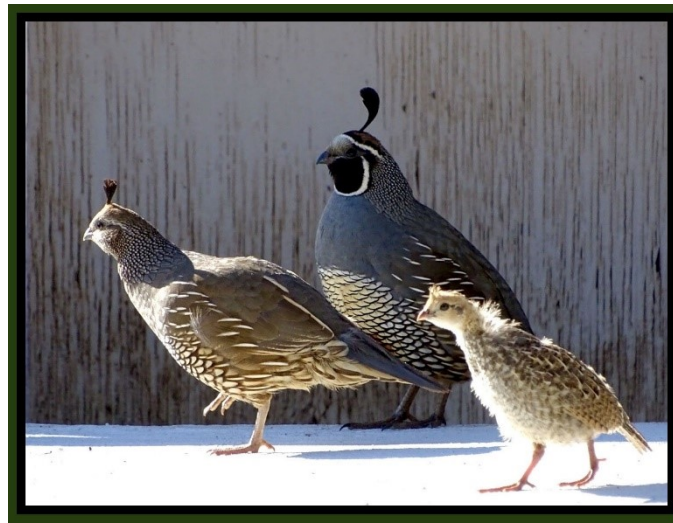
California Quail family at 40 Brett Circle

This December, Parkwood will once again be part of a tradition that is over 100 years old—and you can be part of it. Holiday traditions are generally fun for all, but back in the 1800's, hunters across the U.S. and Canada were practicing one that was not so endearing. Called the "Christmas Side Hunt," the game involved two competing sides of hunters trying to bag the most dead birds.